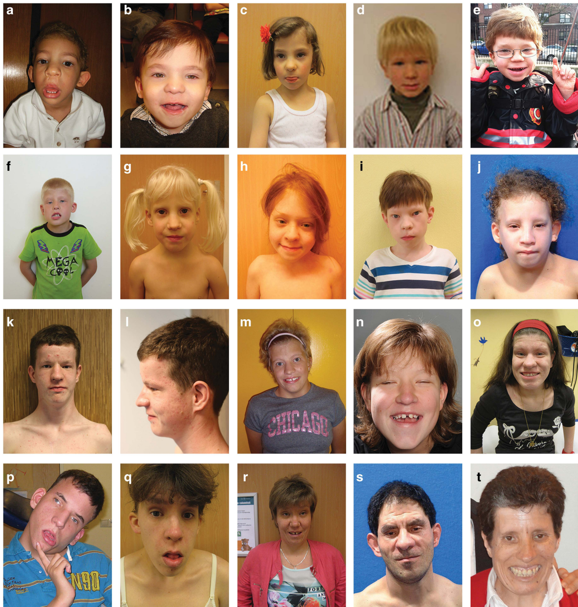
Figure 2 Clinical photographs of individuals with KdVS due to a 17q21.31 deletion. Facial photographs of (a) case 5; (b) case 7; (c) case 10; (d) case 11; (e) case 12; (f) case 14; (g) case 16; (h) case 17; (i) case 18; (j) case 22; (k) case 24 front view; (l) case 24 side view; (m) case 25; (n) case 26; (o) case 28; (p) case 29; (q) case 30; (r) case 31; (s) case 32; and (t) case 33. A written informed consent was obtained for publication of clinical photographs in the medical literature.

communicating hydrocephalus, periventricular white matter changes, 13,22,29 and partial pituitary stalk interruption syndrome. 19 Case 35 presented with a Chiari type 1 malformation, which has also been described by Terrone et al , 23 co existing with a mild anomaly of the medulla oblongata. Three cases in our cohort had spinal cord anomalies, including tethered cord (case 13), hydromyelia of the thoracic cord (case 38), and painful disabling dural ectasia and cysts (case 45). Interestingly, Tan et al 22 also described an individual with scoliosis, dural ectasia and a Tarlov cyst.