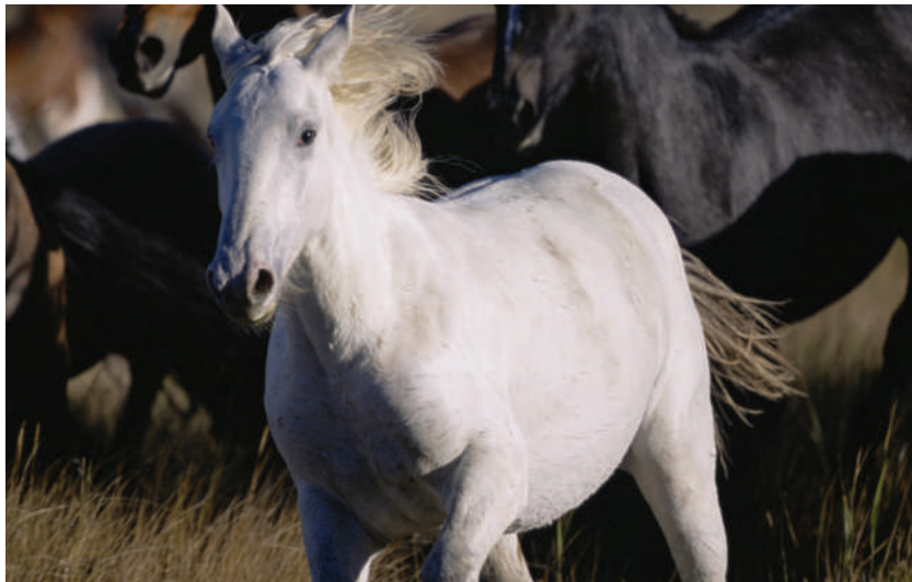
MOMATIUK &amp; EASTCOTT/CORBIS/PHOTOLIBRARY

The authors found that, unlike white horses, dark-coloured horses reflect polarized light, which horseflies can detect. A brown matt cloth attracted horseflies only if it was covered by a transparent, light-polarizing sheet, demonstrating that polarized light, not dark colour, draws the flies.